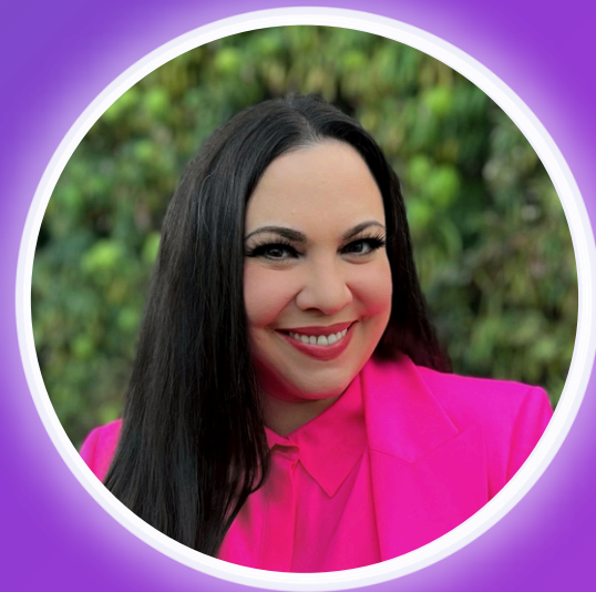
Gloria Calderón Kellet